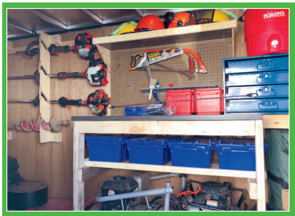
The Saco Bay Trails mobile workshop. The well-organized trailer is easily towed to to the worksite and it has plenty of room for all of our equipment!