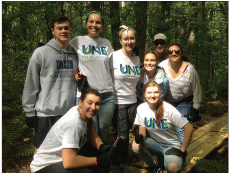
We did some work on our trailhead kiosks in 2019. Top left, the kiosk marking one end of the Atlantic Way. We had help on our trails from a number of groups, including these students from the University of New England, above and this Thornton Academy student, at left.