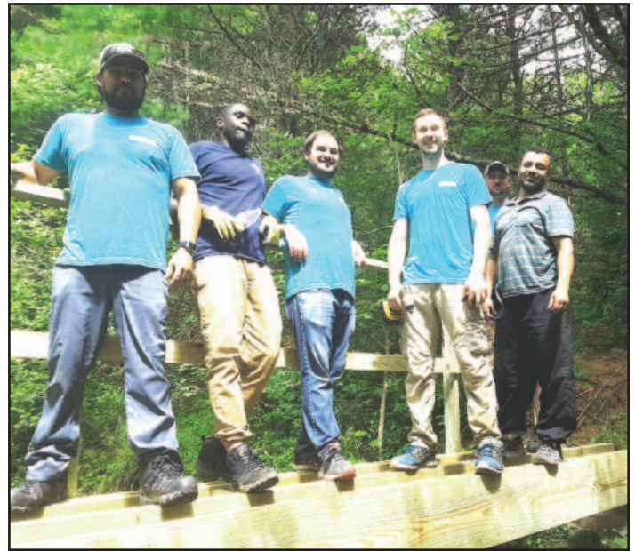
A crew from IDEXX.